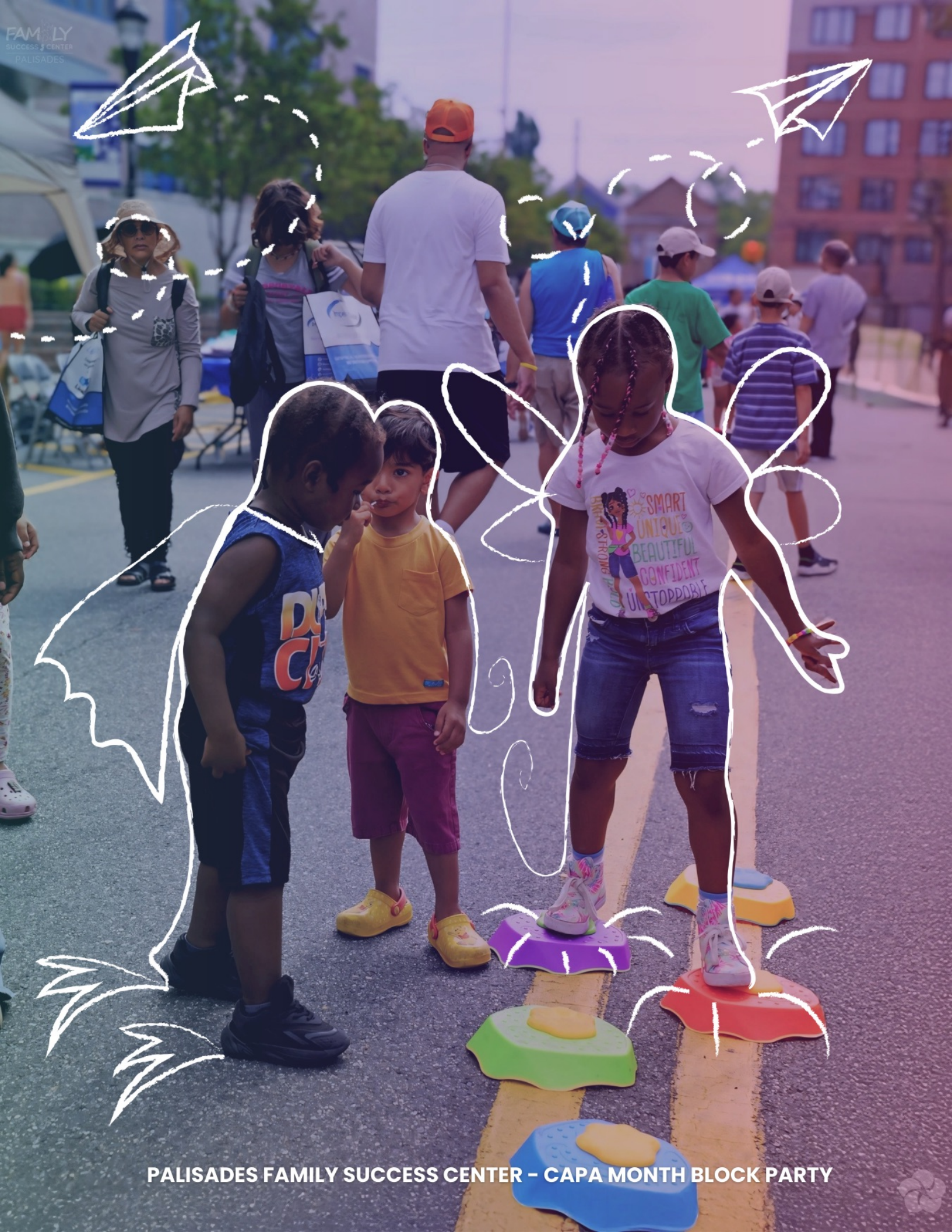
PALISADES FAMILY SUCCESS CENTER - CAPA MONTH BLOCK PARTY