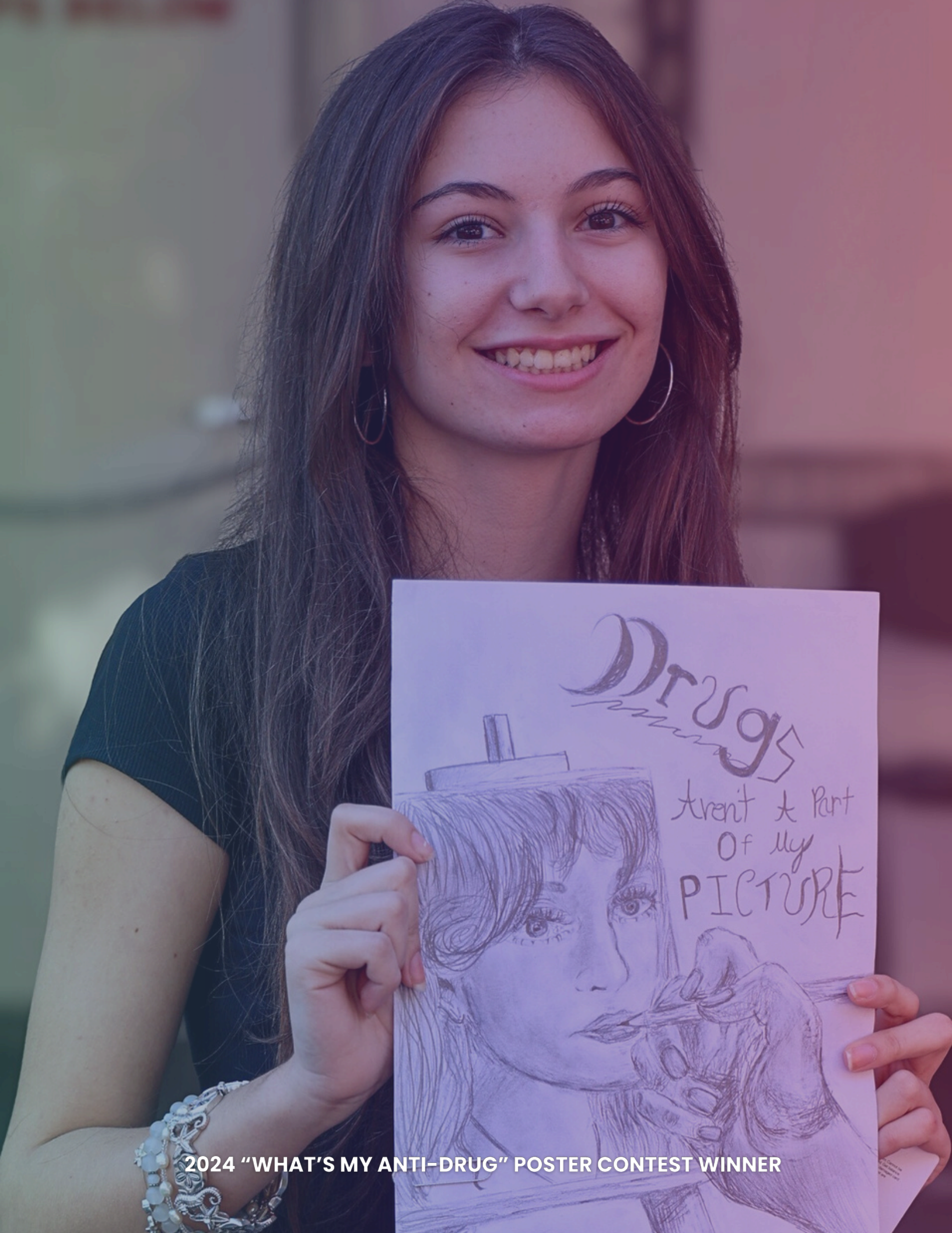
2024 "WHAT'S MY ANTI-DRUG" POSTER CONTEST WINNER