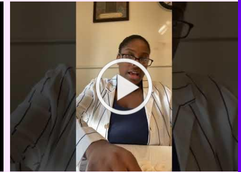
[Shell Memory Game]