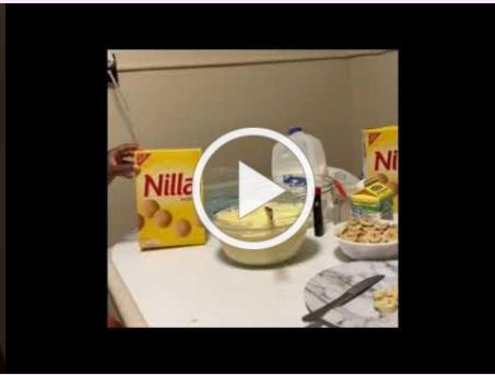
[Banana Pudding Recipe]