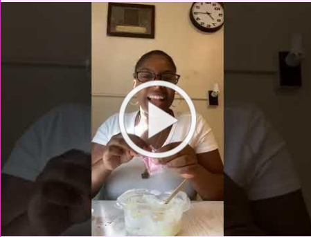
[D.I.Y Body Butter]