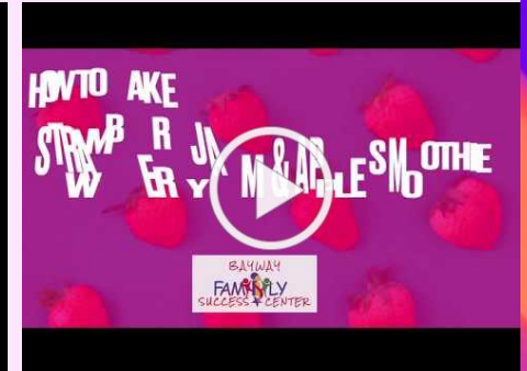
Strawberry Jam & Apple Cinnamon Smoothie

TO SEE MORE, CHECK OUT OUR YOUTUBE AND FACEBOOK PAGE